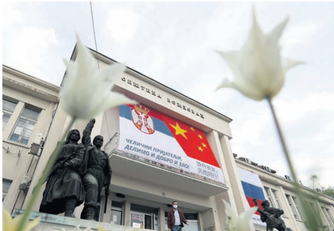
In this April 13, 2020, photo, a man wearing a face mask leaves a municipal office building decorated with billboard showing Serbian and Chinese flags reading: "Iron friends, together in good and evil!" prior a curfew set up to help limit the spread of the new coronavirus in Belgrade, Serbia.

"We must be aware there is a geopolitical component, including a struggle for influence, through spinning and the politics of generosity," EU's top foreign policy official Josep Borrell recently wrote in a blog, referring to China. "Armed with facts, we need to defend Europe against its de-